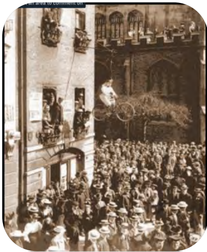
Cambridge Daily News, 21 May 1897.

Did this really happen? Cause that’s hard to believe.